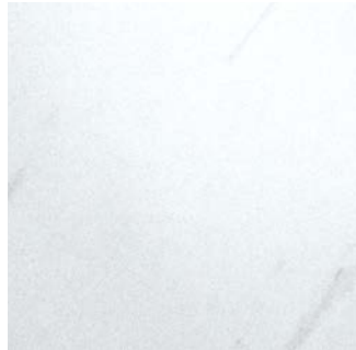
BATHROOM FLOOR TILE