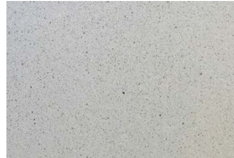
BATHROOM STONE VANITY BENCHTOP