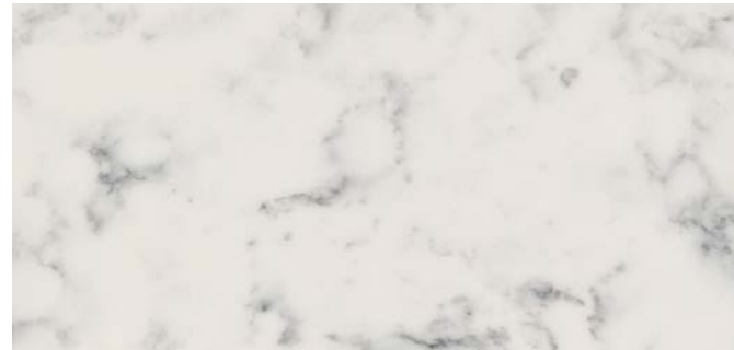
RECONSTITUTED STONE - MAIN UNITS