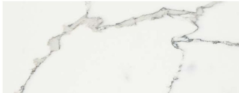
RECONSTITUTED STONE - PENTHOUSE