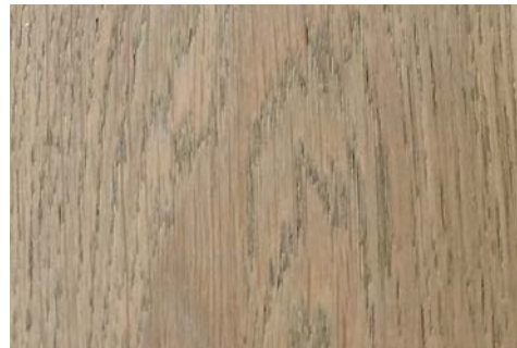
ENGINEERED TIMBER FLOOR