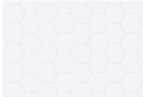
BATHROOM FEATURE WALL TILE